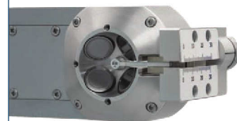
4Ch Focused Circular Through Hole Array with an Integrated OSA

Visit www.rayspec.co.uk to learn more about what we can do for you