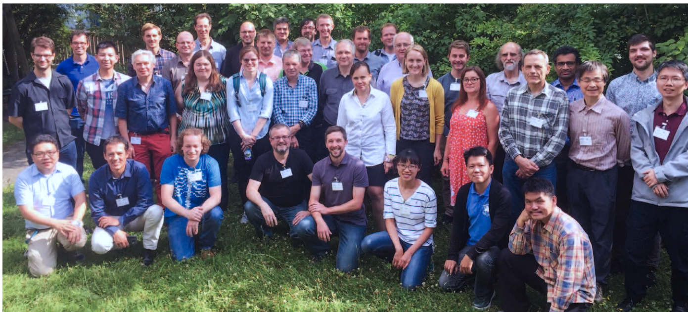
Participants at the canSAS workshop enjoying a break in the sunshine.

The eleventh canSAS workshop was held in Freising, Germany, July 8–10, 2019. These international meetings, promoting collective action for nomadic small-angle scatterers, have been taking place since 1998 and act as forums to catalyze cooperation amongst the SAS community in order to provide better facilities and equipment, combined with reliable data interpretation and analysis. The meeting attracted over 60 participants from major neutron and X-ray laboratories, as well as manufacturers of SAXS equipment, and users from academia and industry. There was also a wide geographical spread with participants from Australia, Asia, and North America joining European colleagues.