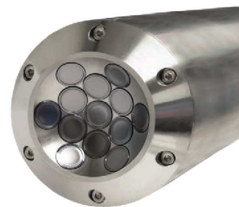
13Ch Focused Circular Array